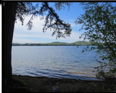
Weeks Beach & Park - Picnicking & swimming, launch your kayak or canoe onto Great East Lake. - 138 North shore Drive E. Wakefield