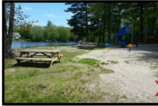
Lovell Lake Town Beach

Swimming, picnicking, playground, & bathhouse.