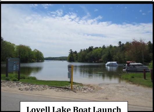
Lovell Lake Boat Launch