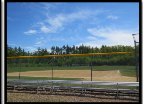
Ballpark Complex - Thompson, Siemon, Dee, & Bardsley fields, playground, & disc golf course ( coming soon! ) - 1488 Wakefield Road - Sanbornville