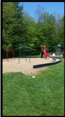
John Garvin Municipal Playground