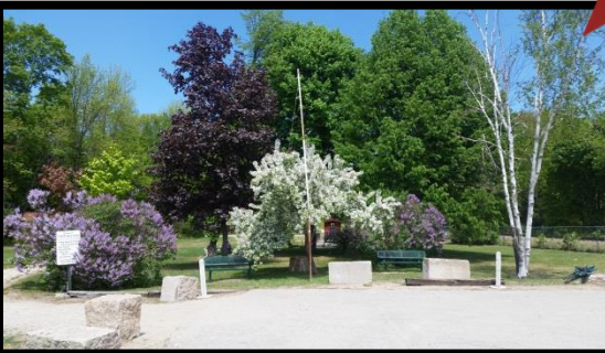
Turntable Park - Basketball court, cotton valley trail, & picnicking.